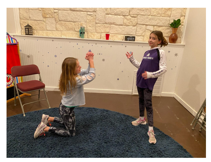
Drama team rehearsing for their performance "The Prodigal Son"

Wednesday nights at Fellowship are back! Since the children's choir is not currently meeting, I am adapting the schedule for children's activities to meet the needs of families who would like to attend adult